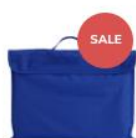
Primary Pete Book Bag Heavy Duty Royal Blue