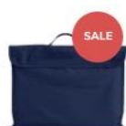
Primary Pete Book Bag Heavy Duty Navy Blue