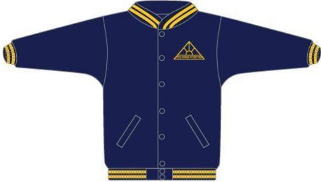
Bomber = $60