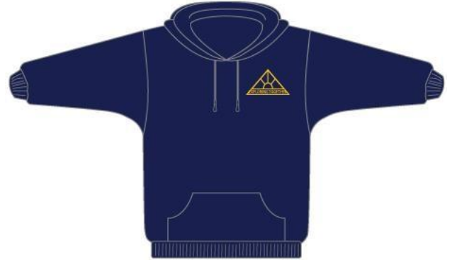
Hoodie = $54

Follow the following easy steps to order your garments online